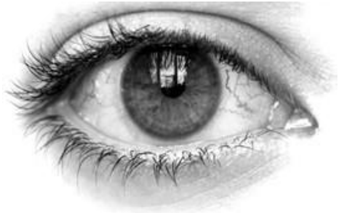
ALT TEXT: Image of an eyeball