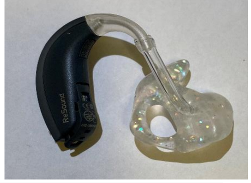
•Step 4: Trim the tubing about quarter of an inch/3mm up from the marked point and then connect the tubing to the hearing aid elbow (hook)

Audiology Department (C41) Royal United Hospital Combe Park Bath BA1 3NG